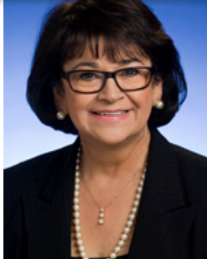
SEN. DOLORES GRESHAM SENATE EDUCATION COMMITTEE CHAIRMAN (Received $15,500 from Students First in 2012)